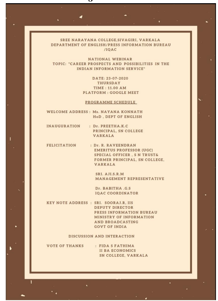
Fig. 2: Programme Schedule