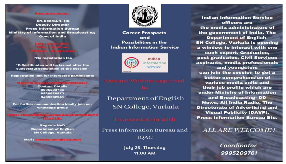
Fig 1. Brochure