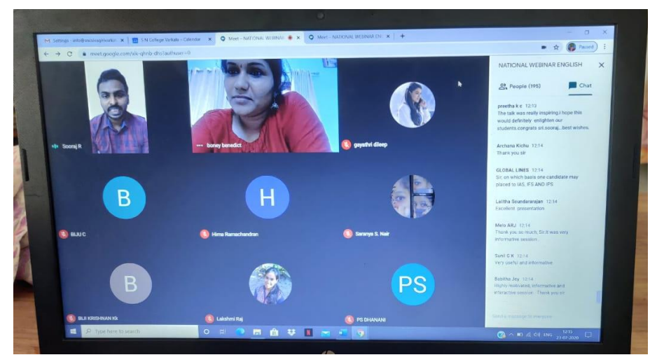
Fig. 4: Glimpse from the session