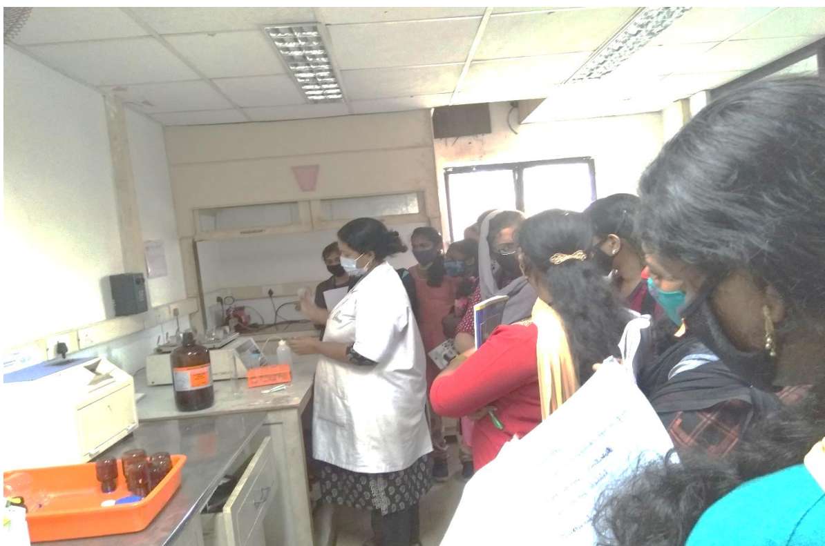
Hands on training programme for students on Residue Analysis using Gas Chromatography at CEPCI, Kollam on 30 th January 2021